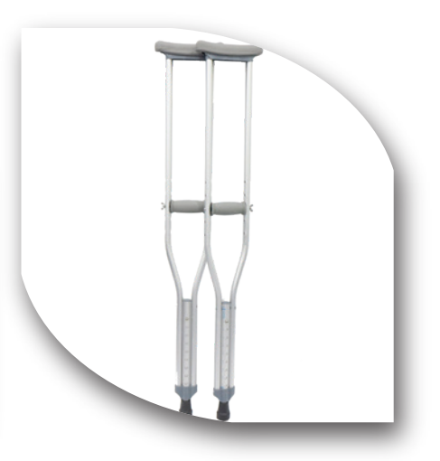
TALL ADULT CRUTCHES

Adjustable Height: 178 - 198cm Colour: Silvery-White